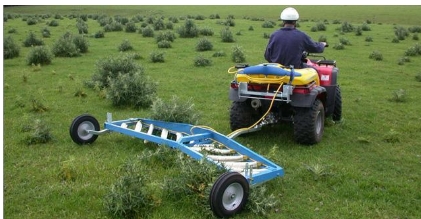
Eliminator weed wiper with effective cover of 2.5m (C-Dax 2010)